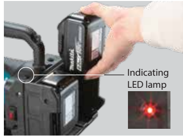
Indicating LED lamp

"In-use" indicating LED indicates which battery is currently supplying power.